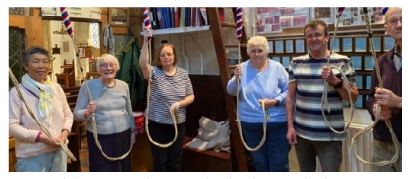
3 · SHIPLAKE WITH DUNSDEN AND HARPSDEN-CUM-BOLNEY BENEFICE PROFILE

The RG9 postcode area is a high-income area with high house prices and an above average number of older affluent professionals. Many work in managerial and professional jobs with the number educated to degree level being well above the national average. In our Benefice, there is a high proportion of retired individuals. There are residents in the area who are on lower incomes or financially dependent on State Benefits. Various support agencies are available.