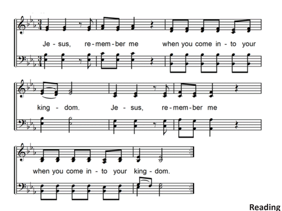
Matthew 5: 17–19