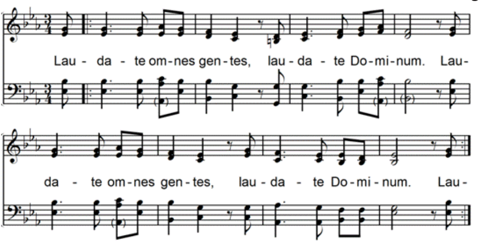
Welcome and Introduction

Officiant The Lord says: I stand at the door and knock.