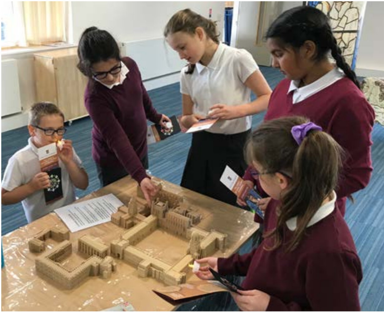
School children trying out a 3D printed copy of Christ Church