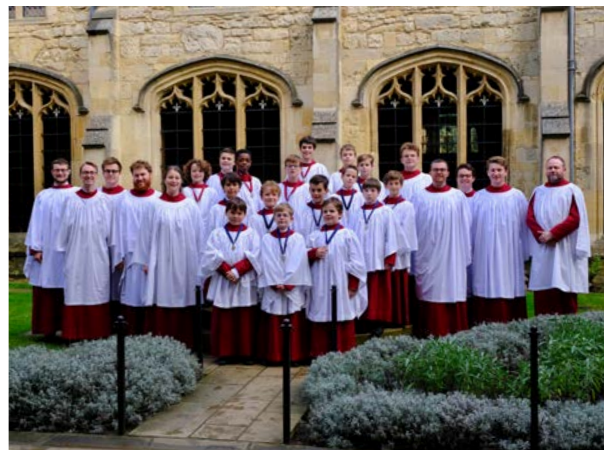
Christ Church Cathedral Choir 2019-20

Because of the COVID-19 pandemic, the choir was unable to go ahead with various events that had been planned for spring and summer: the St John Passion in Holy Week, a choir tour to Sweden, the Summer Gaudy, the Trinity Term outreach concert, two recording projects (music of Charles Wesley and music from the Eton Choirbook), and a concert in the St Marylebone Festival.