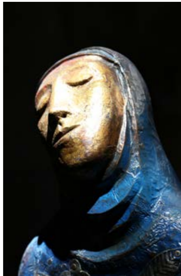
St Frideswide of Oxford

In normal times, the Dean and Chapter warmly welcome parishes in the Diocese of Oxford to visit the Cathedral and share in its worship and discover the history. We hope to relaunch our free 'parishioner passes' and restart organised group visits as soon as it is safe to do so.