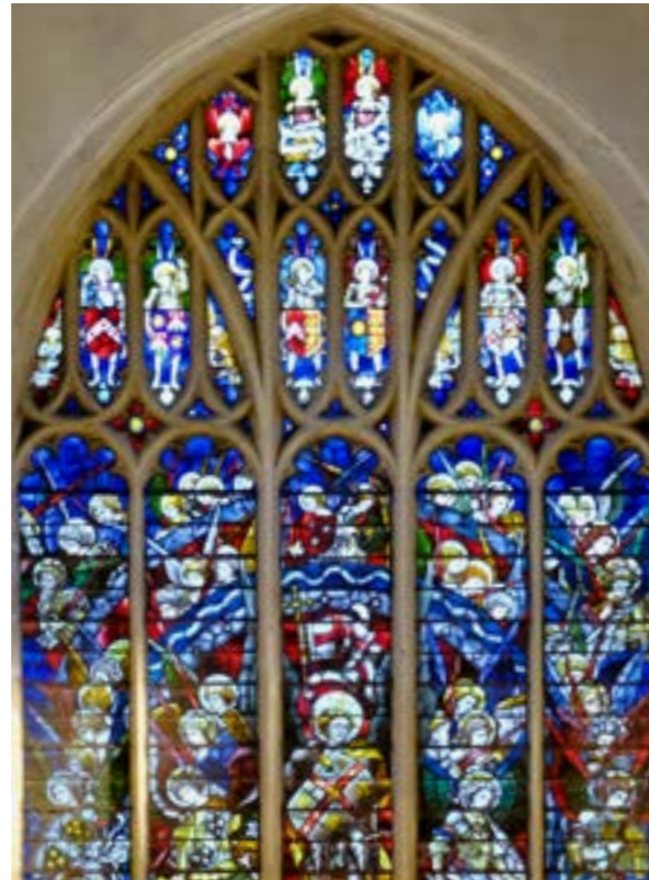
The St Michael window in the North Transept, illuminated by the new lighting